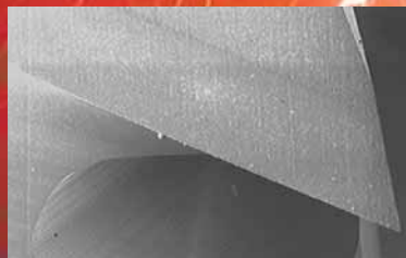
ThunderBolt coated carbide tool